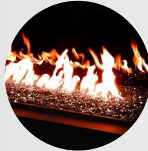
BLACK REFLECTIVE PORCELAIN PANELS