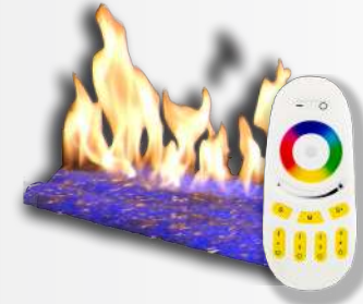
LED LIGHTING WITH REMOTE