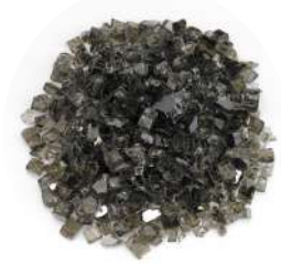
½" GLASS MEDIA Variety of Colors