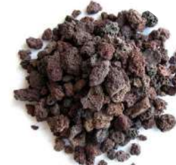
LAVA ROCK Variety of Colors