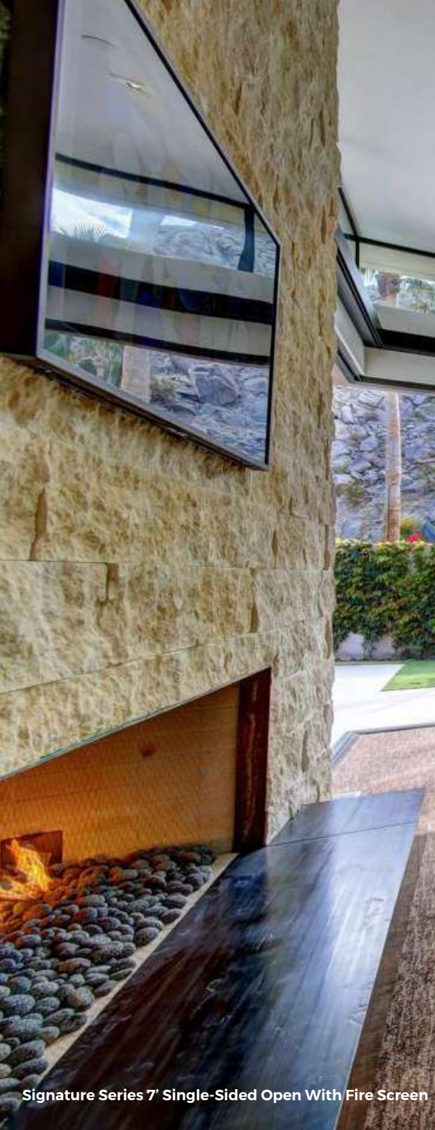
Signature Series 7' Single-Sided Open With Fire Screen