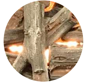
LOG SET Drift Wood