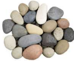
RIVER ROCK Variety of Colors