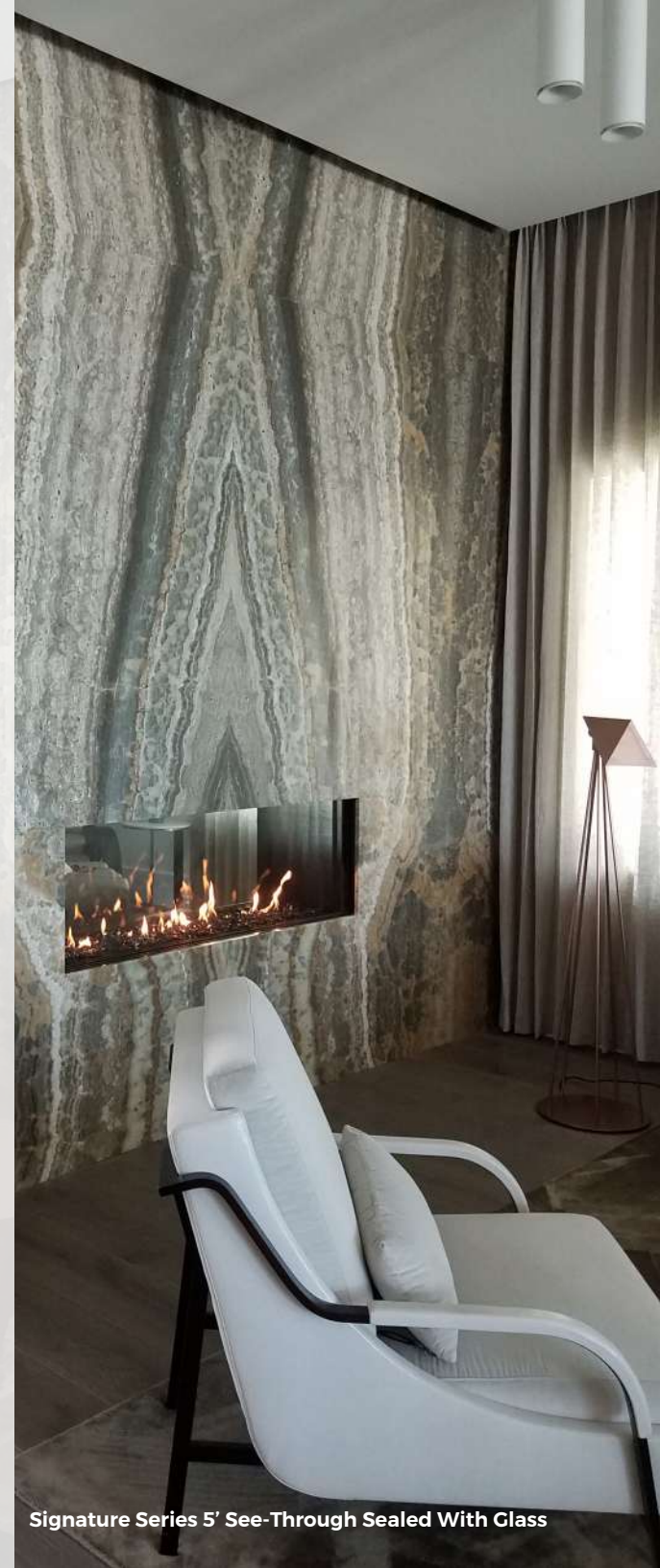
Signature Series 5' See-Through Sealed With Glass