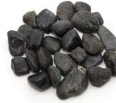
SEMI-POLISHED & POLISHED ROCK Variety of Colors