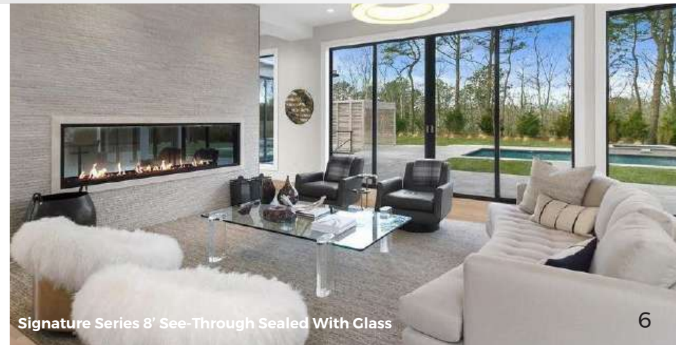
Signature Series 8' See-Through Sealed With Glass

*Auto-Damper Recommended for Open Models