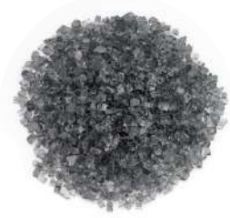
¼" GLASS MEDIA Variety of Colors *Black is Standard